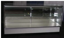
FULL VISION CASE