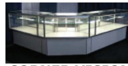
CORNER VISION CASE