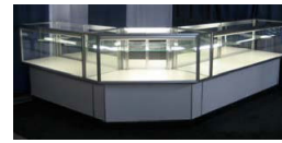
CORNER VISION CASE