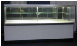
HALF VISION CASE