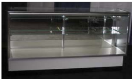
FULL VISION CASE